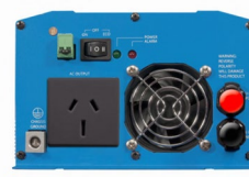
Inverter 12/800 with AN/NZS 3112 socket