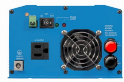
Inverter 12/800 with Nema 5-15R socket