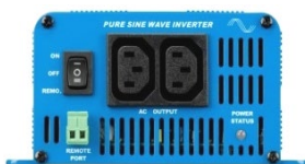
Inverter 12/350 with IEC-320 sockets