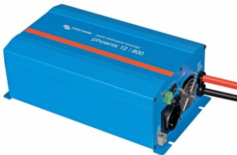
Inverter 12/800 with Schuko socket

For our lower power models we recommend the use of our Filax Automatic Transfer Switch. The Filax features a very short switchover time (less than 20 milliseconds) so that computers and other electronic equipment will continue to operate without disruption.