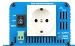
Inverter 12/180 with Schuko socket