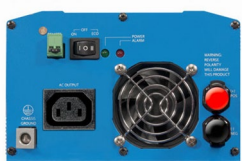
Inverter 12/800 with IEC-320 socket