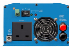
Inverter 12/800 with BS 1363 socket