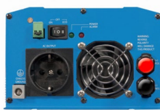
Inverter 12/800 with Schuko socket